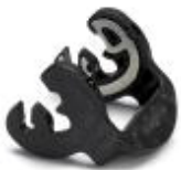
Replacement latch for HC-B10 / HC-B16/ HC-B24 housings with double locking latch (plastic design)

Double locking latch - HC-B 10-24-QB - 1637265