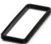
Profile gasket for type B24 supporting base element

Profile gasket - HC-B 24-PR-DI - 1663048