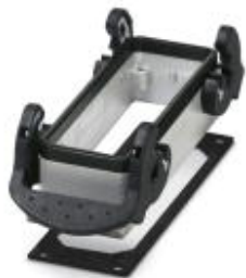
HEAVYCON B24 panel mounting base, with double locking latch, height: 29 mm, with flat gasket

Please be informed that the data shown in this PDF Document is generated from our Online Catalog. Please find the complete data in the user's documentation. Our General Terms of Use for Downloads are valid ( http://phoenixcontact.com/download )